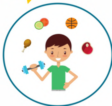
Developing good habits in children