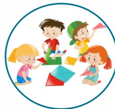
Age & Development appropriate education