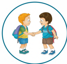
Developing Social Behaviour