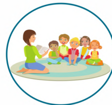
Developing Basic Life Skills